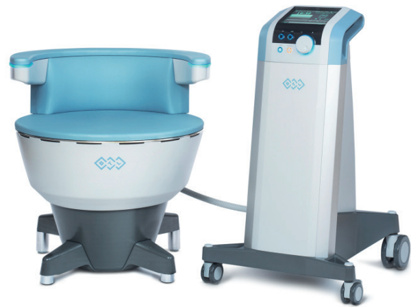
Figure 1: Subject device. The spiral coil is embedded in the center of the therapeutic chair and connected to the main unit which supplies the whole system with power and allows operator to adjust therapy settings.

outcomes, subject's posture was supervised by the therapist and verified by using device's positioning system to achieve optimal PFM contractions.